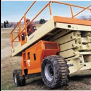
Twin Pump Power Delivers Unmatched Terrainability