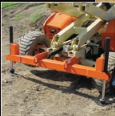
Optional One-Touch Leveling Jacks for Faster Set Up