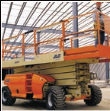
Wide Platforms Get You Closer to Your Work Area